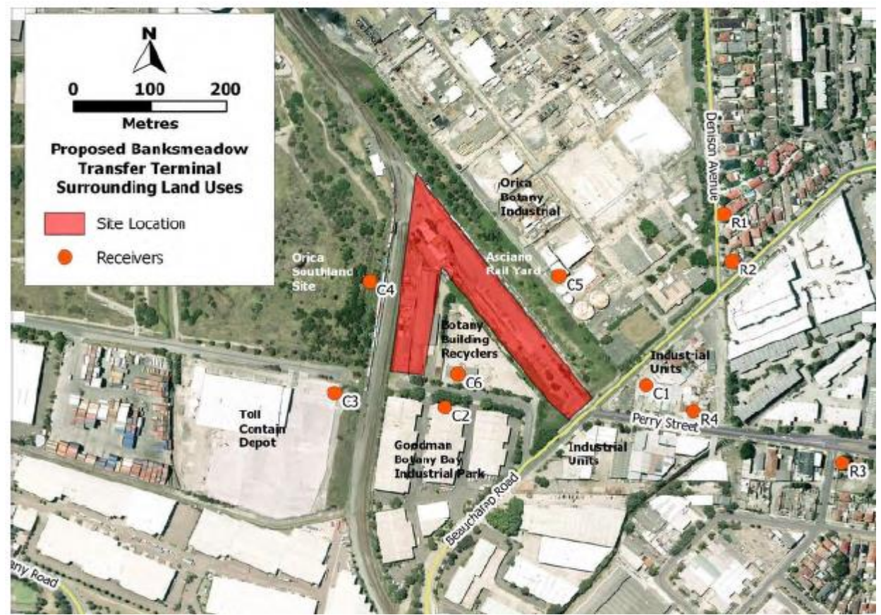
Figure 3.1 Sensitive receivers within proximity of the BTT site